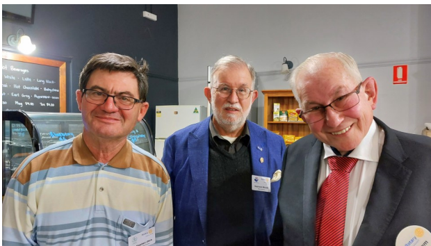
Photo from our last meeting.